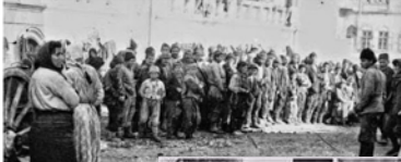
1923 Greek im migrants in Syria